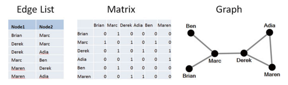
Fig. 2 Three ways of representing network data

represents the number of organizations they are both a part of. Conversely, an organization-to-organization network could be created where a weighted edge represents the number of people who are part of both organizations.