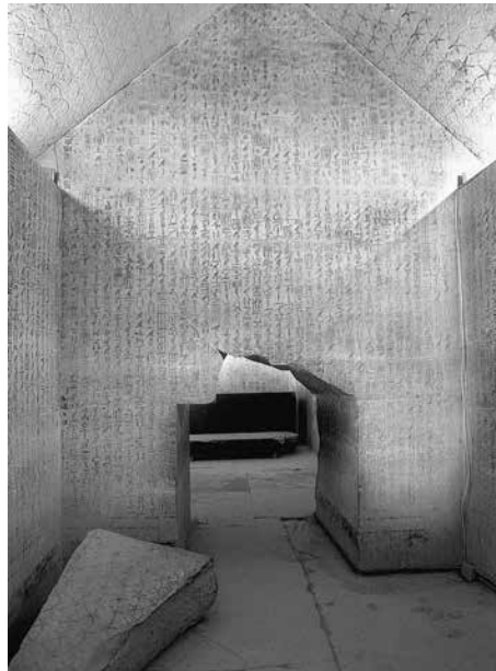
Figure 2.4: The Pyramid of Unis, Saqqara, Egypt.

Which brings us to the pyramids. We'll skip over as no less speculative the various theories about how the pyramids' interior passageways may once have lined up with key stars, or how, taken as a group, they form a sort of primeval star chart. Actually, the pyramids' cosmic connection is much more obvious. For one thing, they're literally giant arrows pointing up at the sky. But even more definitively, we can be certain that the pyramids attest to a celestial awareness because they tell us so. A number of the earliest pyramids contain inscriptions, the so-called Pyramid Texts, consisting of spells and incantations meant to guide the deceased pharaohs on a celestial