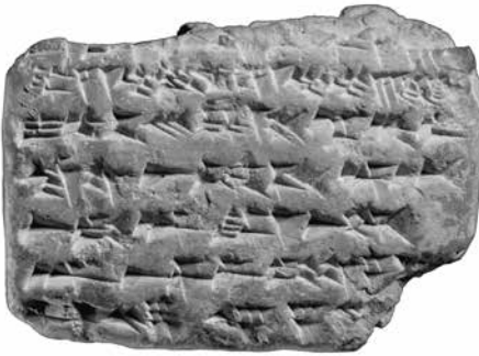
Figure 2.6: A cuneiform horoscope.

Significance: The oldest known personal horoscope.