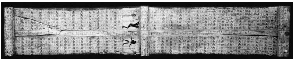
Figure 2.5: An ancient Egyptian coffin lid with a map of the stars.

In ancient Egypt, whoever would be reborn after death, as was the Sun each morning, would need to navigate the same celestial path the Sun took through the underworld each night. It was, presumably, to assist the dead in this journey that certain Egyptian coffin lids were decorated with maps of the stars. Though they're probably knockoffs of an older, royal exemplar, these coffin lids nevertheless have the distinction of being the oldest known maps of the heavens. The stars are arranged in a table, like a spreadsheet, so they're really