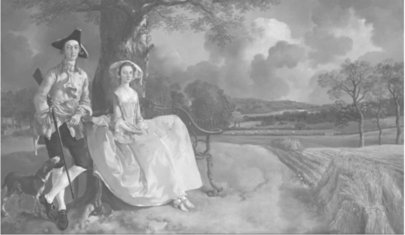
Figure 2. Thomas Gainsborough, Mr. and Mrs. Andrews , circa 1750. The National Gallery, London.